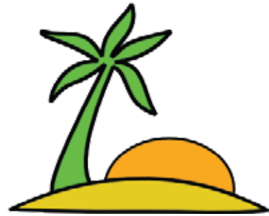
Expenses of our holiday